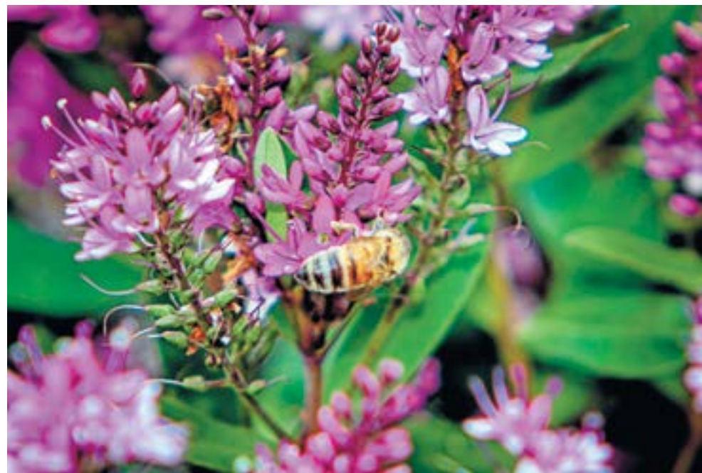
The beauty of creation. (Gary Sissons: 448597)